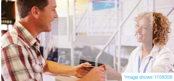
*Image shows 1158358