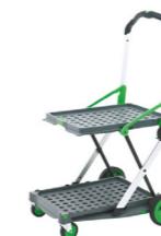
133-7676 Trolley with Folding Box