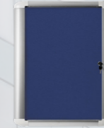
131-5399 Display Case