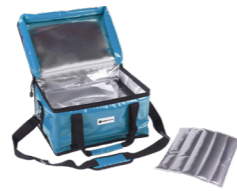
1209851 Vaccine Bag