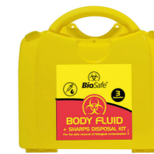
101-2070 Spill Kit

Contact your Account Manager for details.